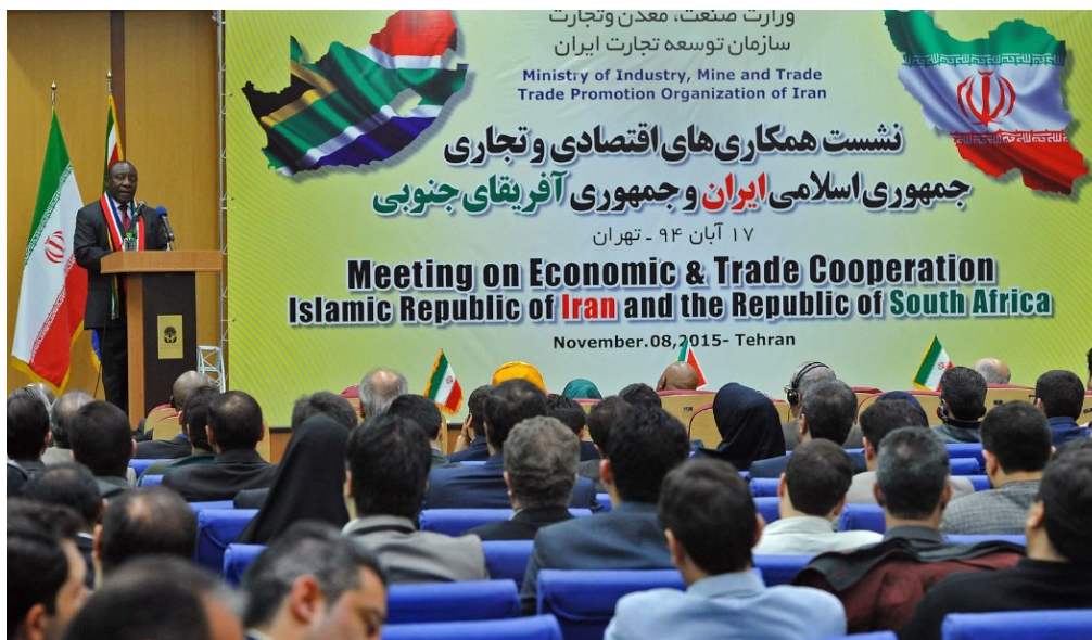
Figure 3: Deputy President Cyril Ramaphosa speaking at a joint South Africa–Iran Economic & Trade Cooperation meeting in Tehran, November 8, 2015 148

In addition to the corruption allegations, Ramaphosa’s tenure also coincided with significant avoidance practices by MTN. According to a joint investigation by the amaBhungane Centre for Investigative Journalism and Finance Uncovered, MTN moved over R4 billion ($212 million) from countries including Nigeria and Ivory Coast to Dubai and Mauritius in 2008–2013 under the guise of “management fees.” 149